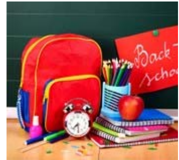
Back To School: Features, News & Ph