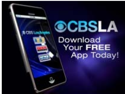
CBSLA iPhone App: Download Today!