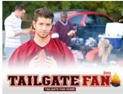
Create A Tailgate & Invite Your Friends